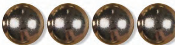
NICKEL (N) FINISH