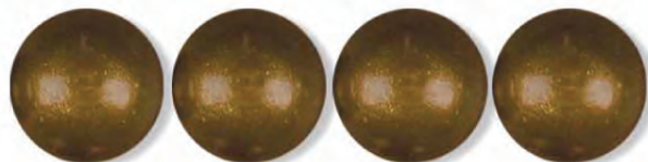
FRENCH NATURAL (FN) FINISH

Nailhead photos are not to scale. Photography is shown to give approximate representation of finish color. Please be advised that not all finishes are available on all styles.