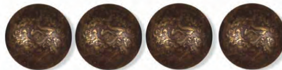
DISTRESSED (Z) FINISH

Nailhead photos are not to scale. Photography is shown to give approximate representation of finish color. Please be advised that not all finishes are available on all styles.