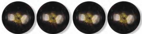
BRONZE (B) FINISH

Wood finish variations are considered normal due to the natural differences in wood tones, grain patterns and dye lots. Please be advised that not all finishes are available on all styles. Please refer to the style page for further information.