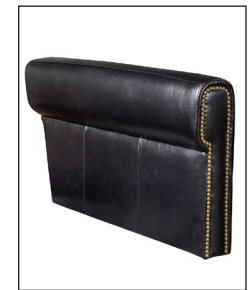
30056 Arm Width: 6"