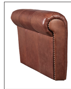
30054 Arm Width: 8"