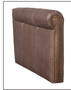
30053 Arm Width: 6"