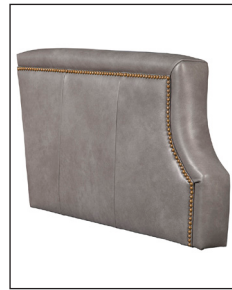
30052 Arm Width: 5"