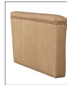
30055 Arm Width: 4.5"