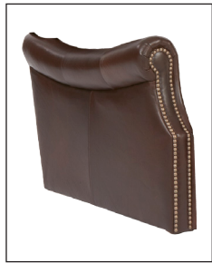
30029 (as shown) Arm Width: 5.5"