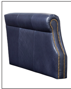
30051 Arm Width: 6"